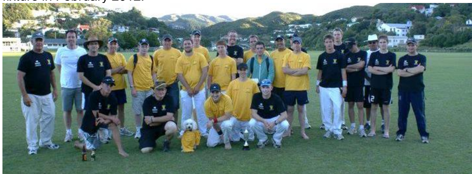
Everyone involved enjoyed the Inaugural Cricket match

The Challenge Cup is in the hands of the President's XI until at least the next fixture in February 2012.