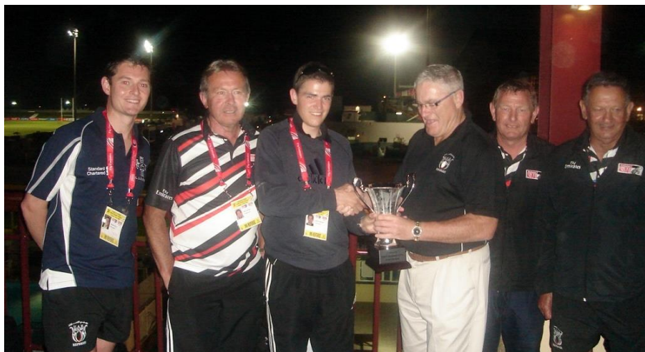
Dubai Interchange December 2012